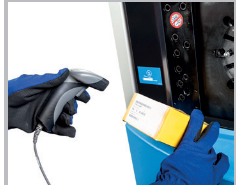
Bar code reader as an option.