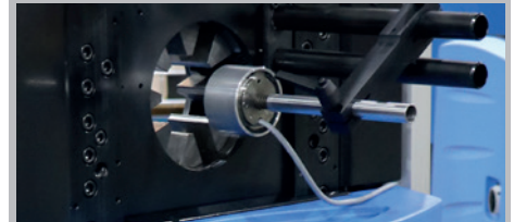
Electric backstop device as a standard feature.

** Will have impact on motor size, hydraulic unit dimensions and weight.