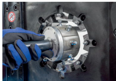
Die sets can be installed into the master dies with a QuickChange-tool one set at a time.