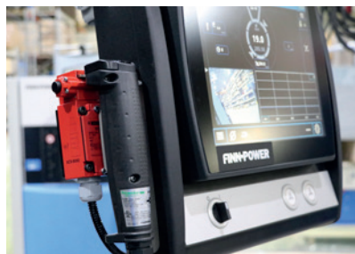
Remote control unit as a standard feature.