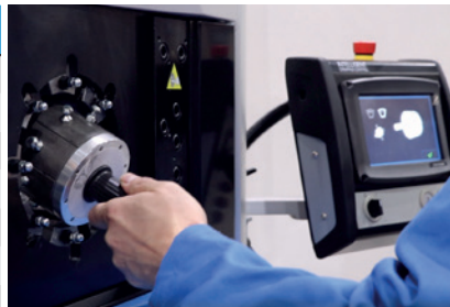
Die sets can be installed into the master dies with a QuickChange-tool one set at a time.