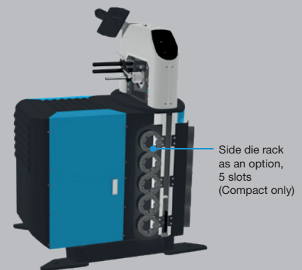
Side die rack as an option, 5 slots (Compact only)

In addition to the standard die sets, a wide range of special die sets is available on request.